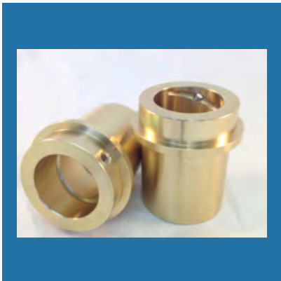
Aluminum Bronze Parts