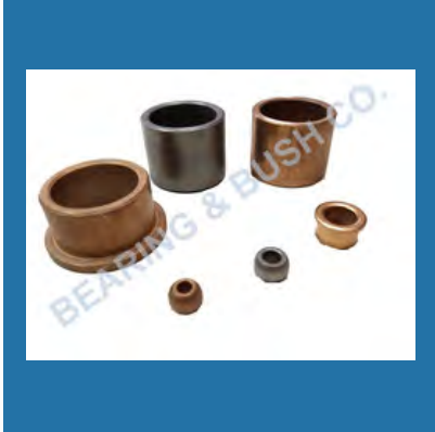
Sintered Bushes & Parts