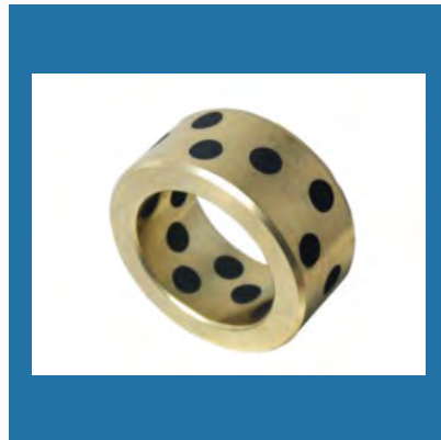
Graphite Bronze Bushes