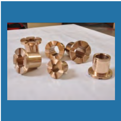
Gun Metal Bushes for Automotive Industry