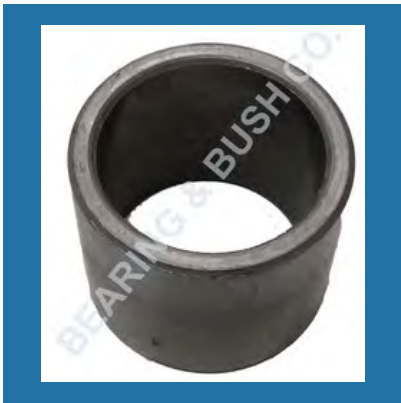
Sintered Iron Bushes