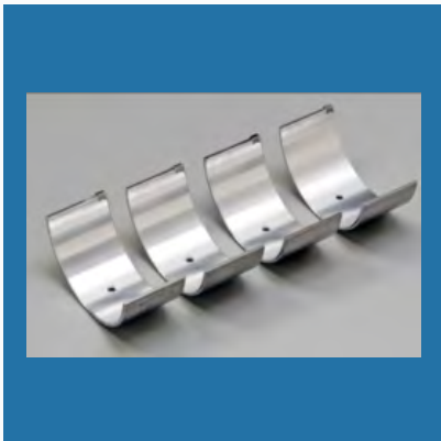
Steel Backed White Metal Bearings