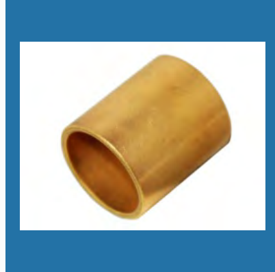
Sintered Bronze Bushes