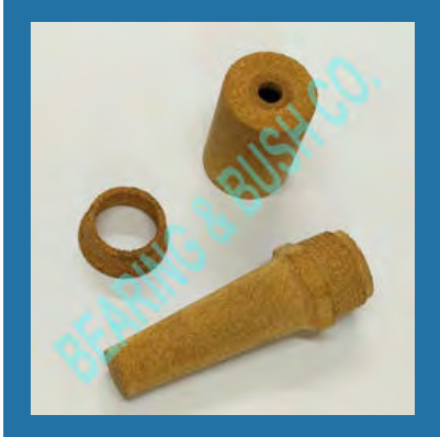
Sintered Bronze Filter