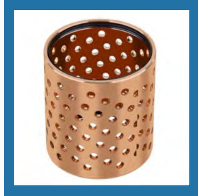
Brass Hot Rolled Sheet