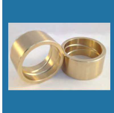
Phosphor Bronze Bushes