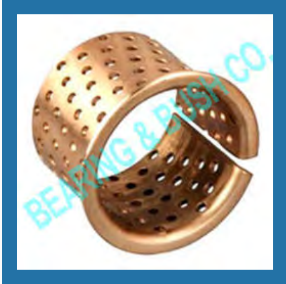
Homogeneous Bronze (Cu 91,3%, Sn 8,5%, P 0,2%)