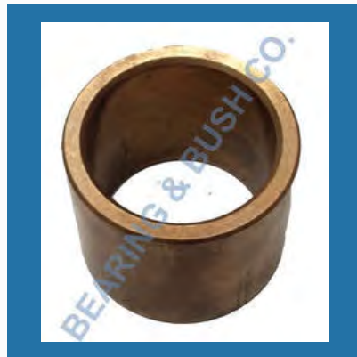
Sintered Bronze Bearing