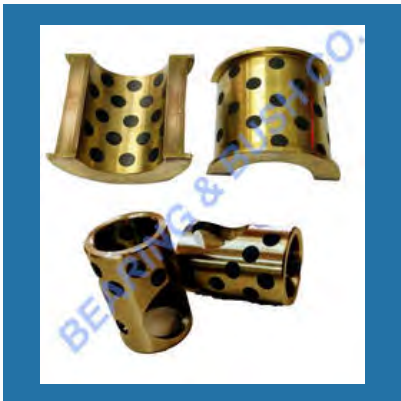
High Tensile Manganese Bronze Bushes