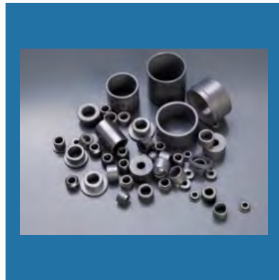
Iron Sintered Bushes