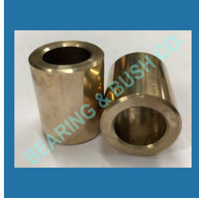
Gunmetal Bronze Bushes