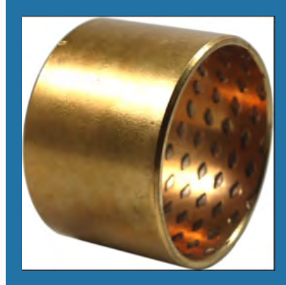
Steel Backed BI Metal Bearings